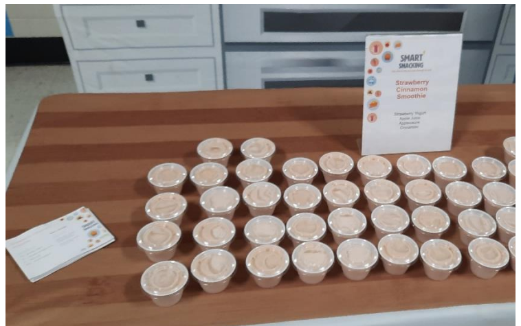
Samples and recipe cards for the students at EW Fritsch Elementary