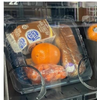
A complete meal ready to go in the HTC at CHS.